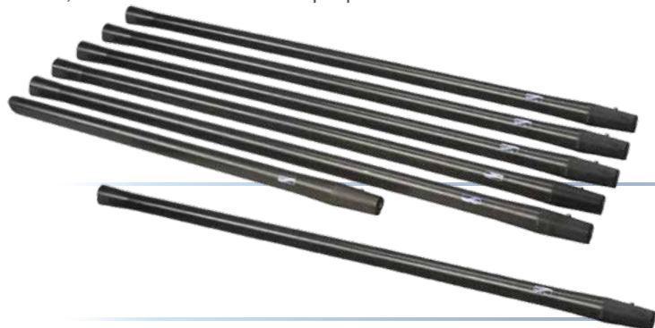
Trend Line 35 carbon pole set 9 meter - 5x 150 cm - 1x 120 cm with protective rubber cap