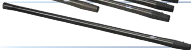
Trend Line 35 carbon extend pole 150 cm