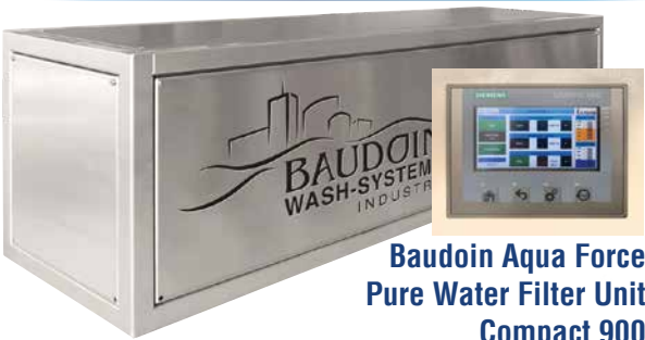
Baudoin Aqua Force Pure Water Filter Unit Compact 900