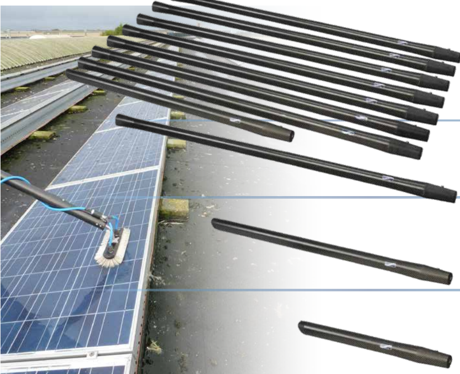
Trend Line 45 carbon pole set 13,4 meter - 7x 170 cm - 1x 120 cm with protective rubber cap