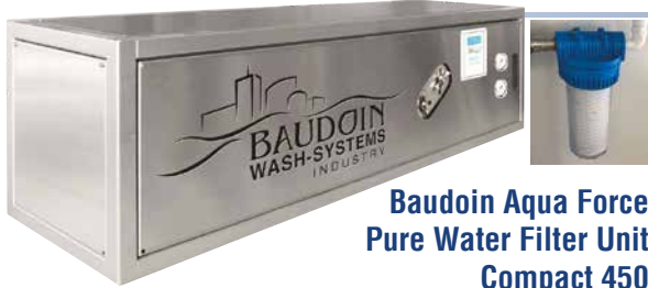
Baudoin Aqua Force Pure Water Filter Unit Compact 450

Pure water is required to obtain a stripeless and shiny result. We develop and manufacture our own pure water filtration units to high standards. Low-maintenance and easy-to-use units to fill your tank(s) with ultra-pure water. With a mobile unit you can work directly from the unit.