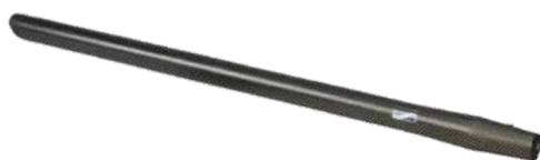
Trend Line 35 carbon extend pole 120 cm with protective rubber cap