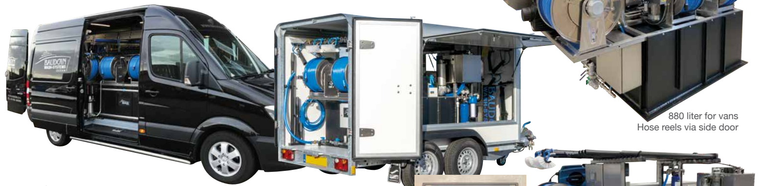
880 liter for vans Hose reels via side door